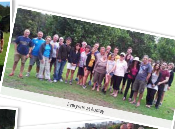
Everyone at Audley