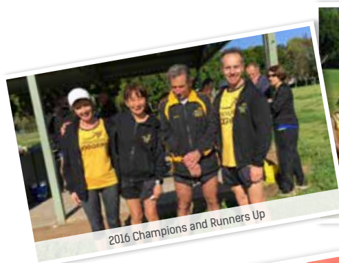
2016 Champions and Runners Up