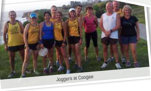
Joggers at Coogee